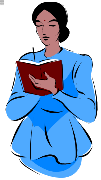
English as a Second Language